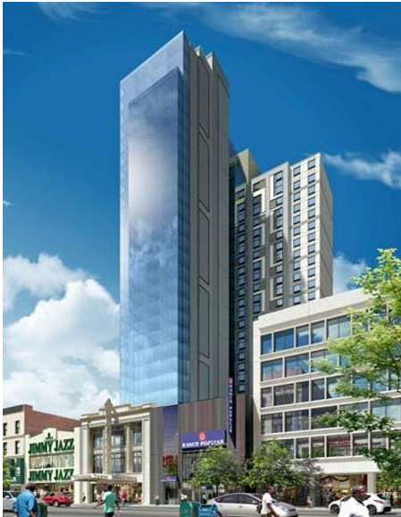
Victoria Theater Project, Rendering Courtesy of Aufgang Architects, LLC